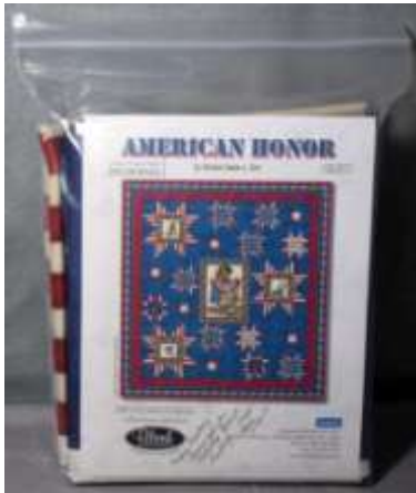
American Honor Applique Quilt Kit

North Texas Quilt Festival, Arlington TX www.sewingexpo.com