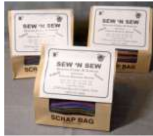
Sew 'N Sew