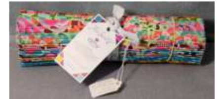
Homespun Quilter's Guild