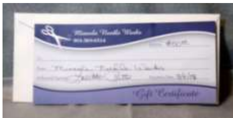
Mineola Needle Works