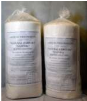
American Fiber Products