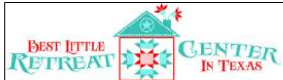
Best Little Retreat Center in Texas