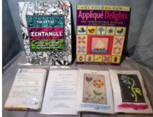
Piecemakers of Rains County