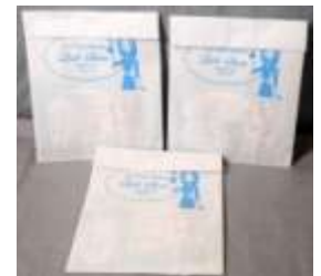
Not Your Mama's Quilt Store