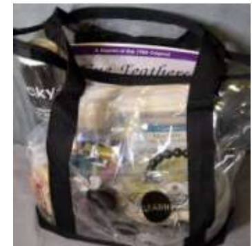
North Texas Quilt Festival, Arlington TX