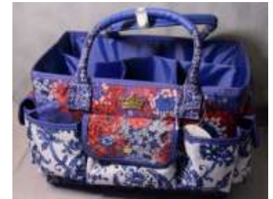
Bear Creek Quilt Guild, Inc.