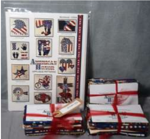
designs by tana