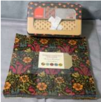
Quilters Guild of Plano