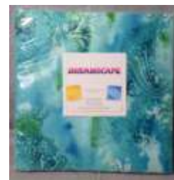
Best of Bernina