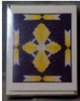
J. Michelle Watts Designs LLC