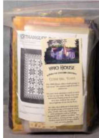
1890 House, A Quilter's Retreat,