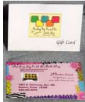
Minding My P's and Q's Quilt Shop Blue Ribbon Quilt Shoppe