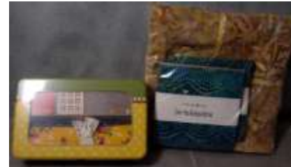
Cotton Patch Quilt Guild