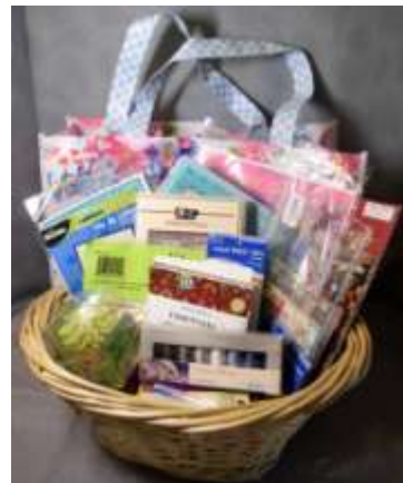
Quilters Guild of Grand Prairie