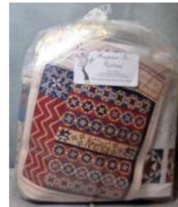
Star Spangled Liberty Quilt Kit Retail value $239.99

Quilt Mercantile 215 N US Highway 69 Celeste, TX 75423