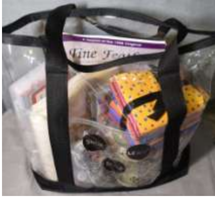
Large gift bags