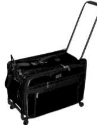
Tutto Black Large Machine Machine on Wheels

designs by tana 904 N. Crowley Rd Ste C & D, Crowley TX 76036