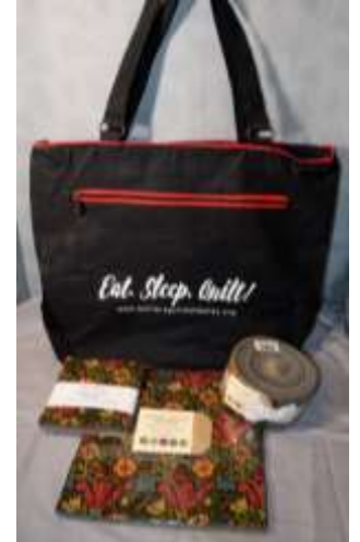
Quilter's Guild of Dallas