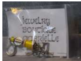
Jewelry Boutique Gabrielle