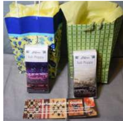
Garland Quilt Guild