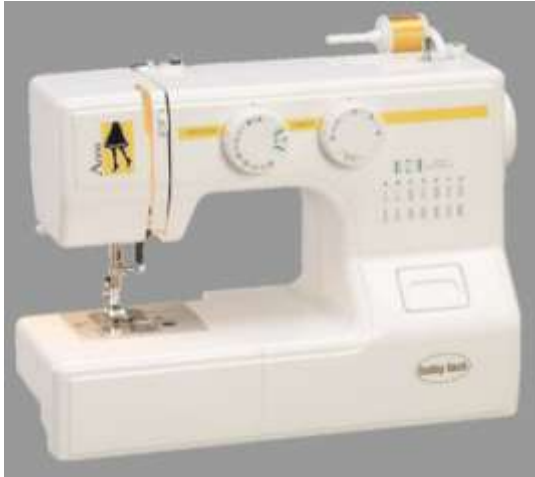
Plano Sewing Center

Our goal is to have 100 door prizes to give away at RD 2017! The first door prize to be given away is: