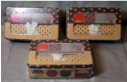
Rocking Bobbin Quilt Shop