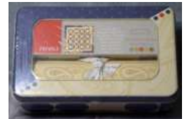
Material Girl Quilt Shop