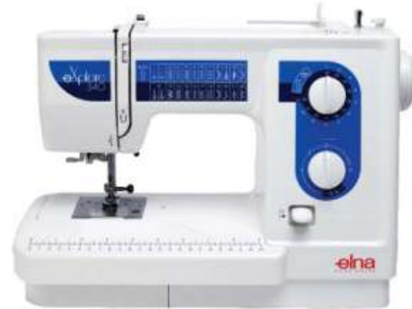
Elna 340 Sewing Machine Retail value $499.00

There are 6 separate choices for Rally Day 2017 Raffle. Drop your tickets in the buckets for the appropriate choice. Tickets will be sold at Rally Day between 9:00a.m. and the drawing at approximately 2:45p.m.