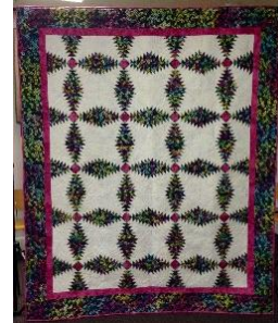
Cotton Patch Guild