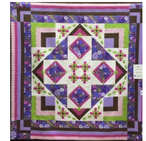
Gun Barrel Guild