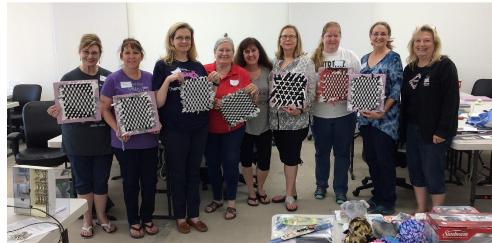
Fun at the April Workshop