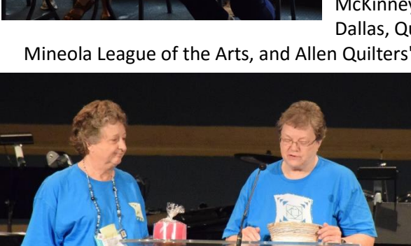
hard to make this day a success.