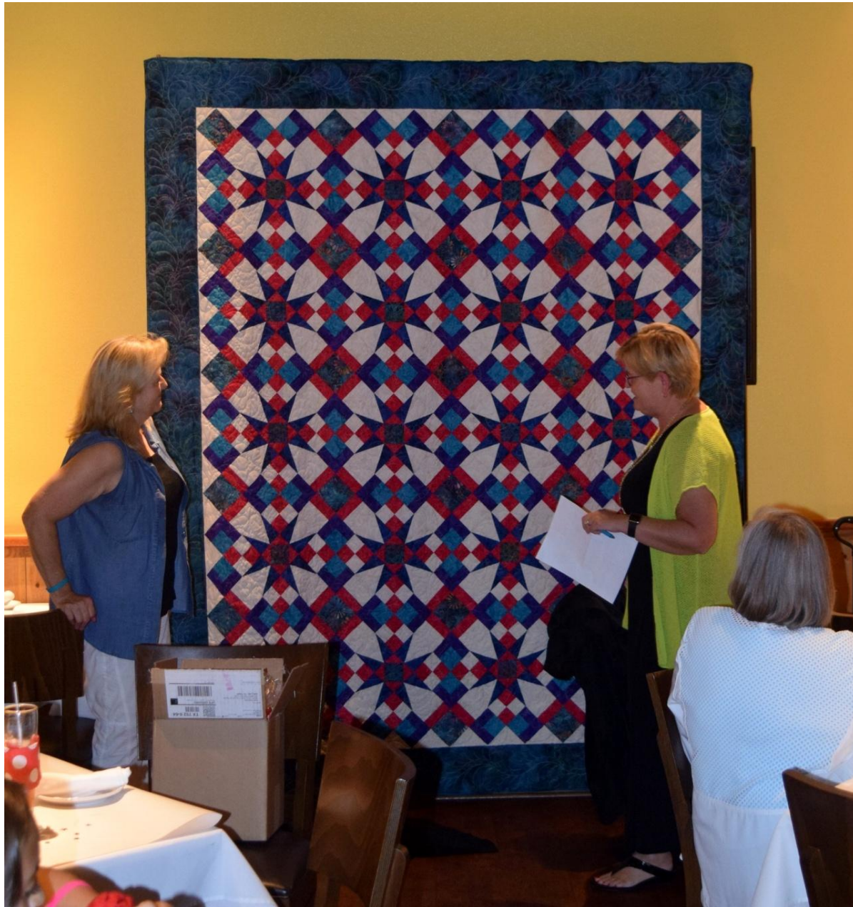
The 2017 Raffle Quilt was premiered at the QP2016 Volunteer Reception

Be sure to see the quilt at the October meeting! Here are a couple of photos from the reception.