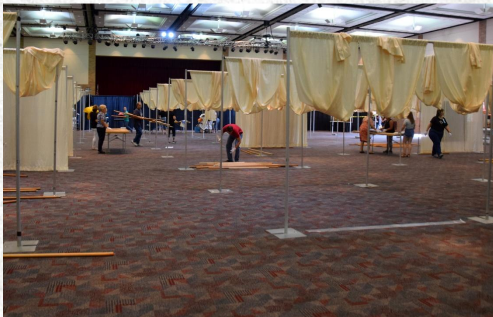
One Last Shot