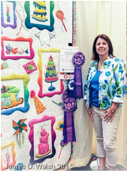
Members' Choice and Viewers' Choice— "One Cake, Two Cake, Red cake, Blue Cake"