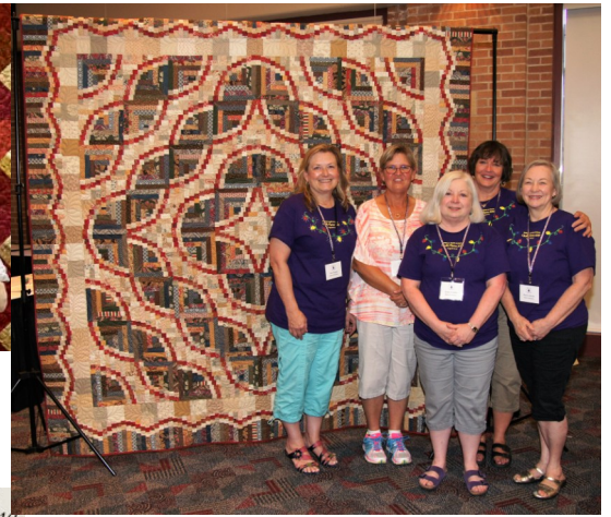
Raffle Quilt for Plano Quilt Show 2016