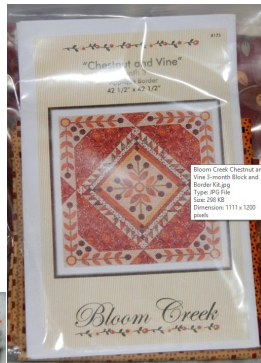
Bloom Creek Chestnut & Vine 3 month block & Border Kit (top right)