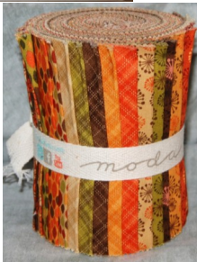
Moda Posh Pumpkin 20 5-inch strips (Center)

If you would like to participate in the Birthday Quilt Challenge for 2015, the rules are simple. Just make a quilt and donate it to Community Service in the month of your birth. If your birth month is January you have until the February meeting. Prizes will be given at the end of the year.