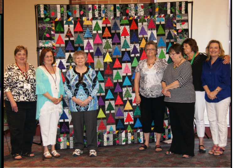
Raffle Quilt for Quilt Plano 2015— "Fiesta Christmas" Presented by the "Plain O' Piecers" (Blocks were made by 53 of our guild members.)