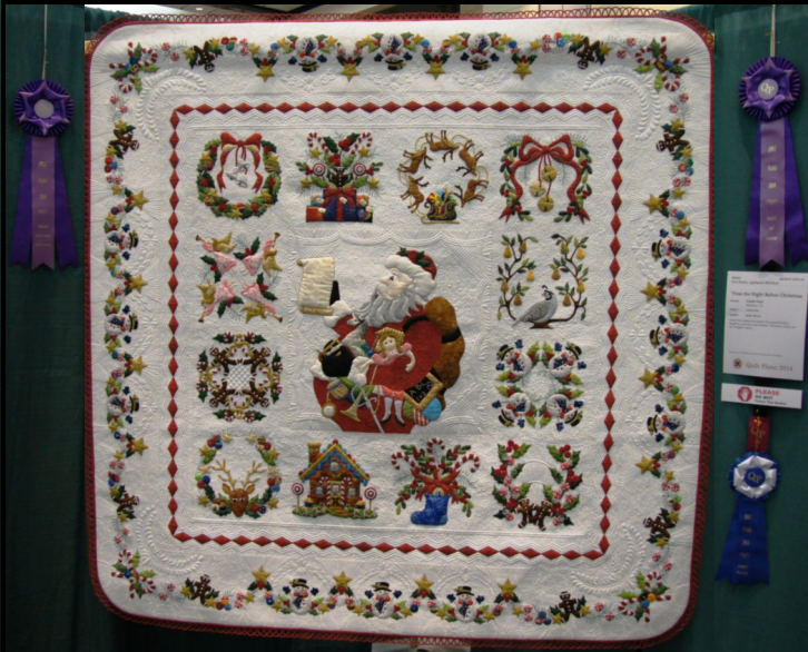
"Twas The Night Before Christmas" by Linda Neal Awards Included, "Best of Show, Viewers Choice And Merit Machine Quilting".