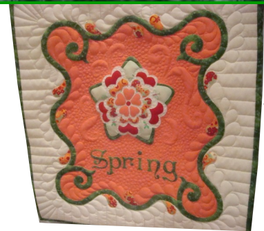
Pam Wingate 3rd Place