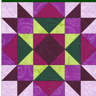
Block 11 due in March