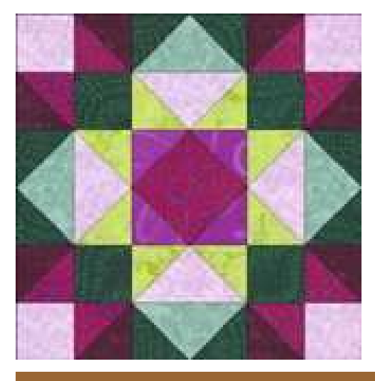
Block 3 due in November.

Be thinking about an original setting for your "Quiltmaker's Puzzle" quilt. I highly recommend two books by Sharyn Craig, <u>Setting Solutions</u> and <u>Great Sets</u>. Either of these books will blow your mind when you see all the setting ideas!