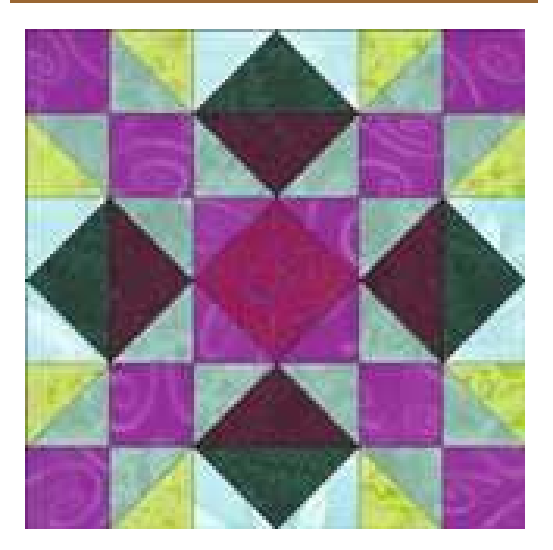
Block 4 due in November.