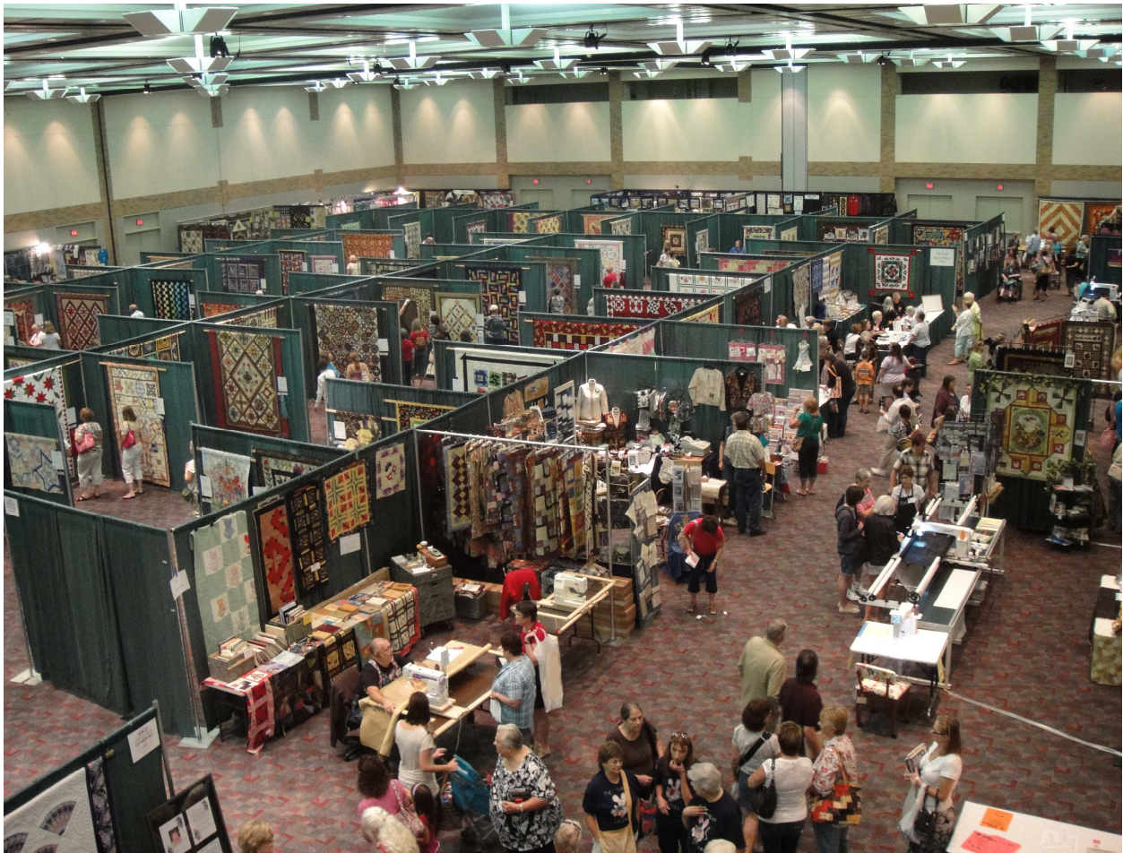
Quilt Show 2011

Quarter Page: 1 month = $25 3 months = $60