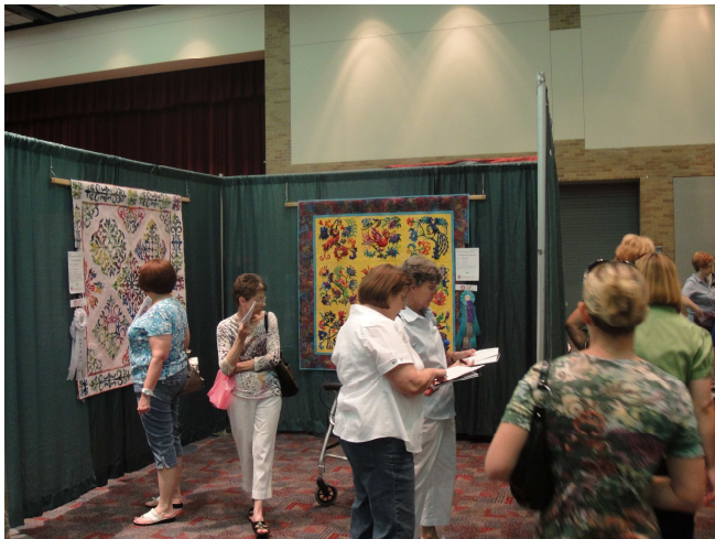
Quilt Show 2011